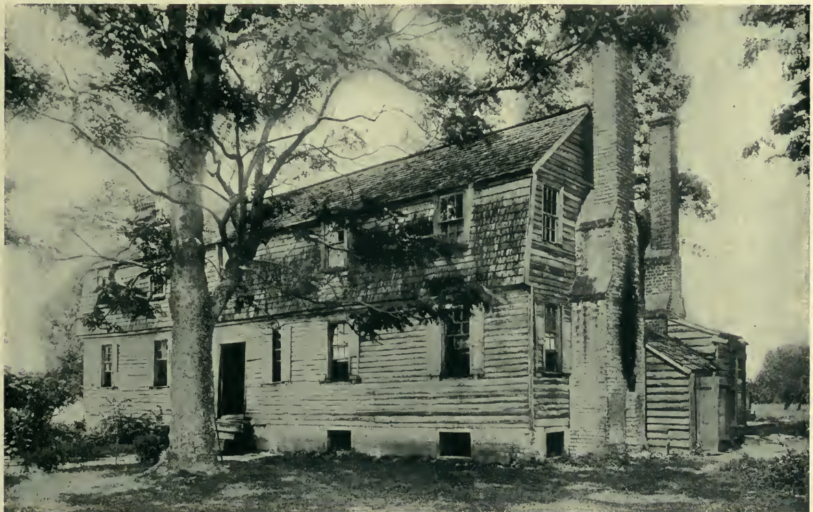
THE PENDELTON HOUSE, NEAR RICHMOND, VIRGINIA

The early Virginia colonists built their houses of wood. A characteristic feature of these early houses was the chimney at each end built outside the house wall for its entire height. The occurrence of the gambrel is not nearly so frequent as in the North, and there are few examples of framing with the overhang